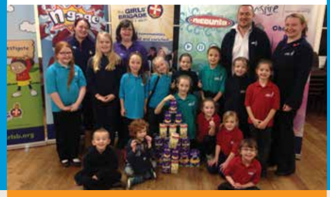
THE GIRLS' BRIGADE ENGLAND & WALES

1st Huncote n:vestigate group is flourishing in an area of rural Leicestershire.